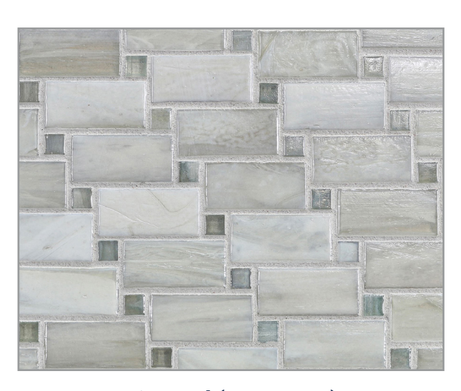
\underset{\scriptscriptstyle (12\,mm\,x\,12\,mm,\,25\,mm\,x\,52\,mm)}{Vineyard} \, ({}^{1\!/}_{\!2}\,x\,{}^{1\!/}_{\!2},1\,x\,2)