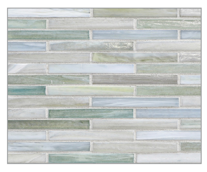
^{1/_{2}} \times 4 Brick ^{(12 mm \times 100 mm)}