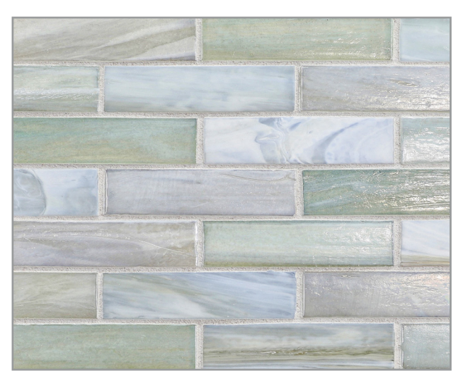
1 \times 4 Brick (25 mm x 100 mm)