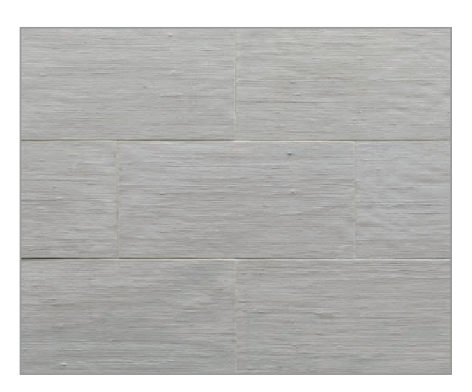
Homespun~(6\,{\rm x}\,12) This softly textured, versatile tile is inspired by natural linen fabric.