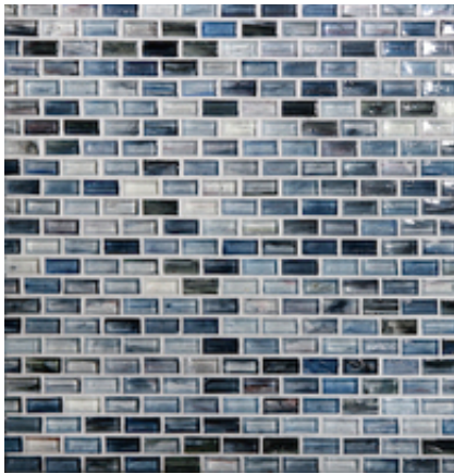
Tozen 1/2 x 1 Brick