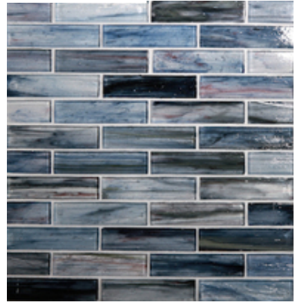
Tozen Tanzanite 1 x 4 Brick